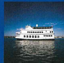
Cruise Around Charleston Harbor