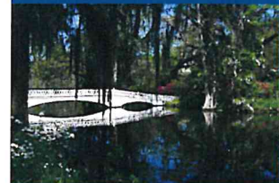
Take in the Picturesque Views of Charleston

Day 5: Enjoy a Continental Breakfast before departing for home... a perfect time to chat with your friends about all the fun things you've done, the great sights you've seen and where your next group trip will take you!