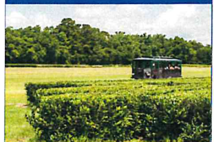
Tour Charleston Tea Gardens