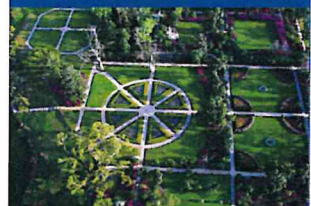
Visit Middleton Place and Gardens